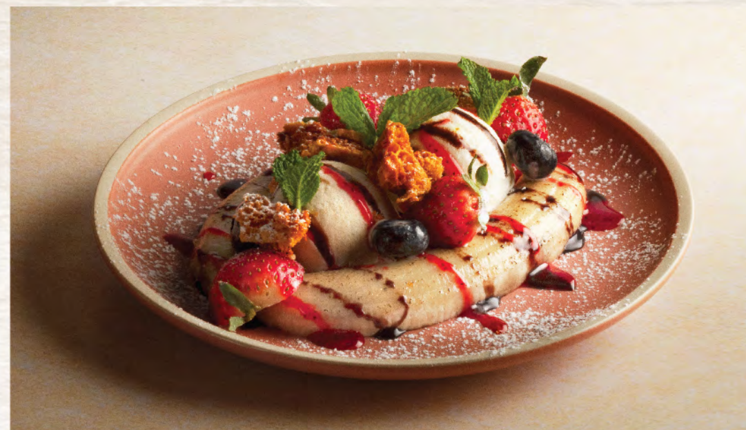
Banana Split Ice Cream 懷舊香蕉船