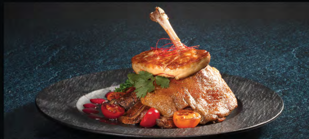
Slow-cooked French Duck Thigh with Pan-fried Goose Liver 慢煮法國鴨腩配香煎鵝肝