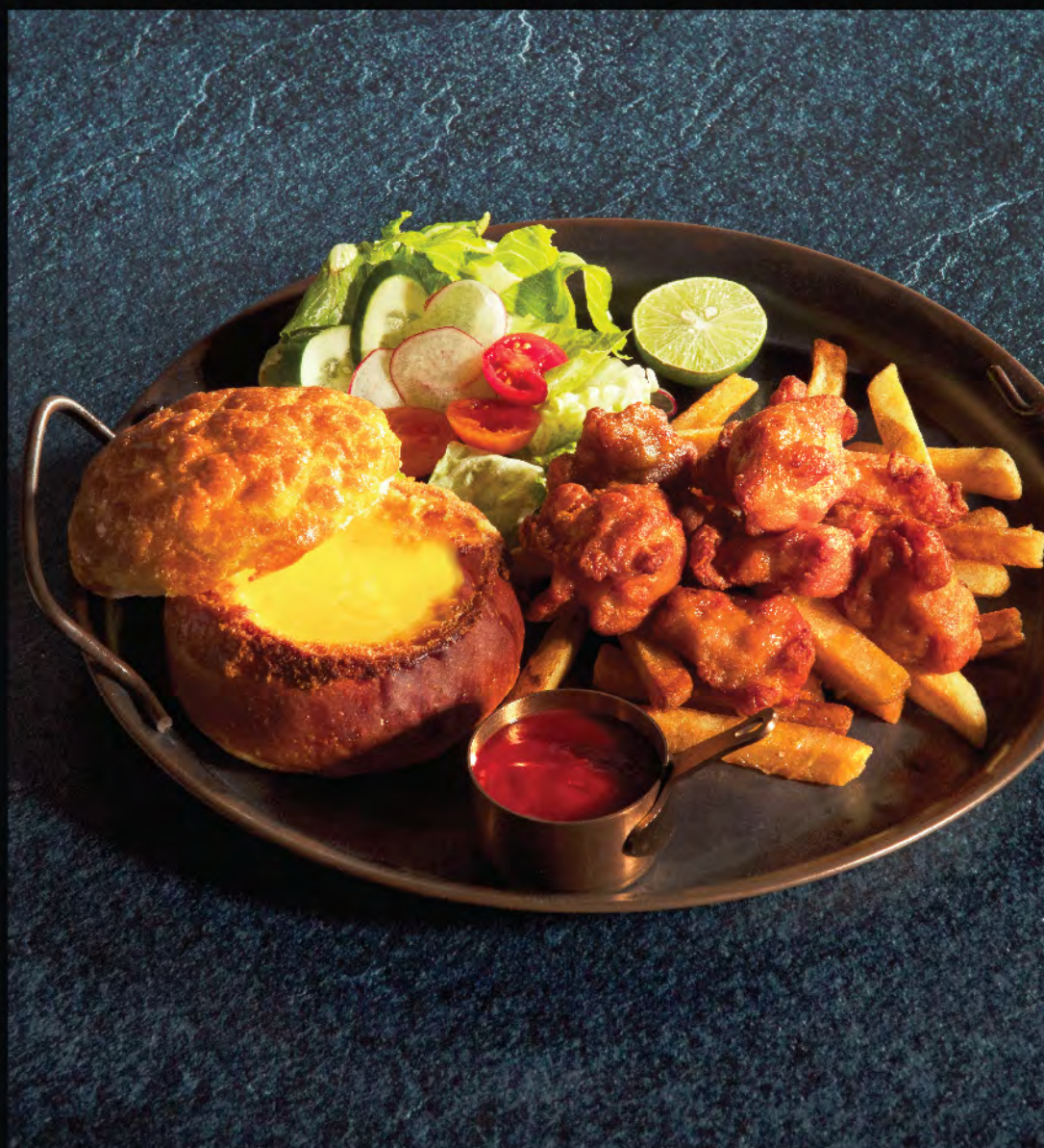
Deep-fried Garlic Chicken Pieces with Triple Cheese Pineapple Bun 三重芝士菠蘿包配蒜香炸雞件