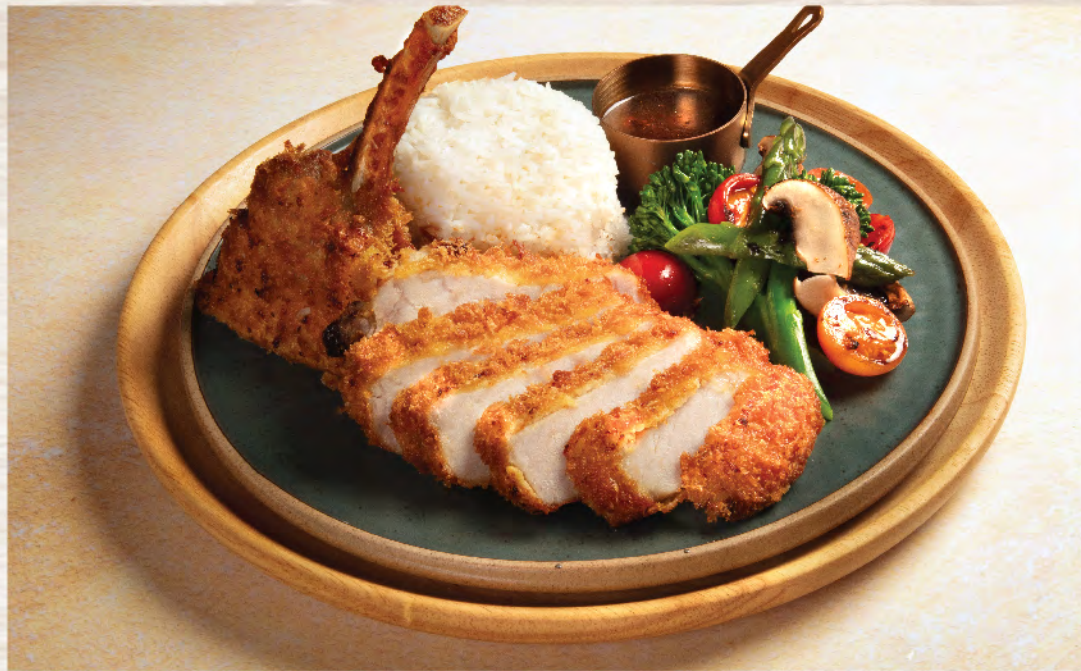
Thick-cut Kurobuta Pork Cutlet Rice 厚切吉列黑豚豬扒飯