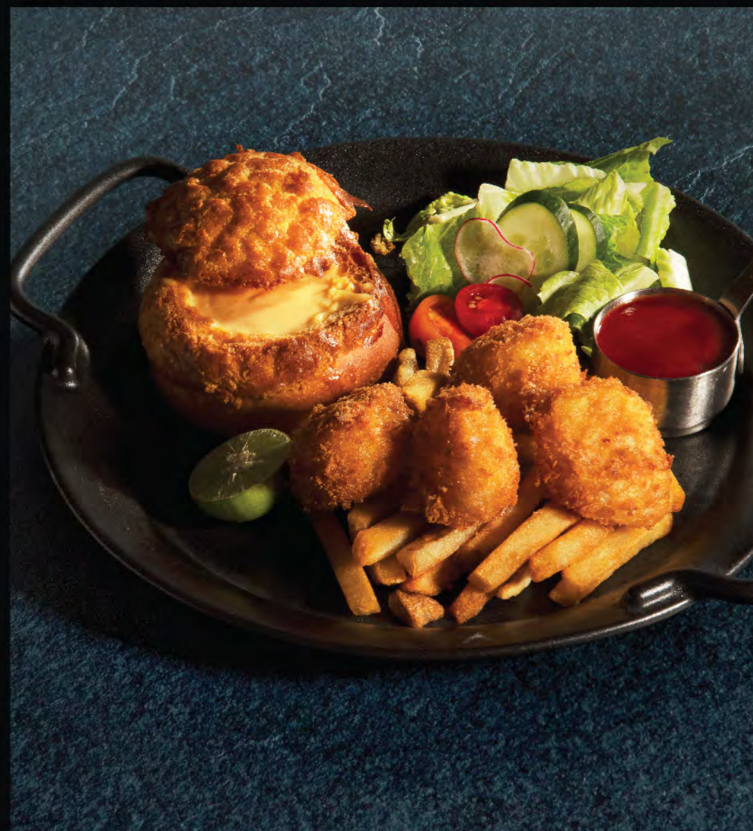
Deep-fried Jumbo Scallop with Triple Cheese Pineapple Bun 三重芝士菠蘿包配炸珍寶帶子