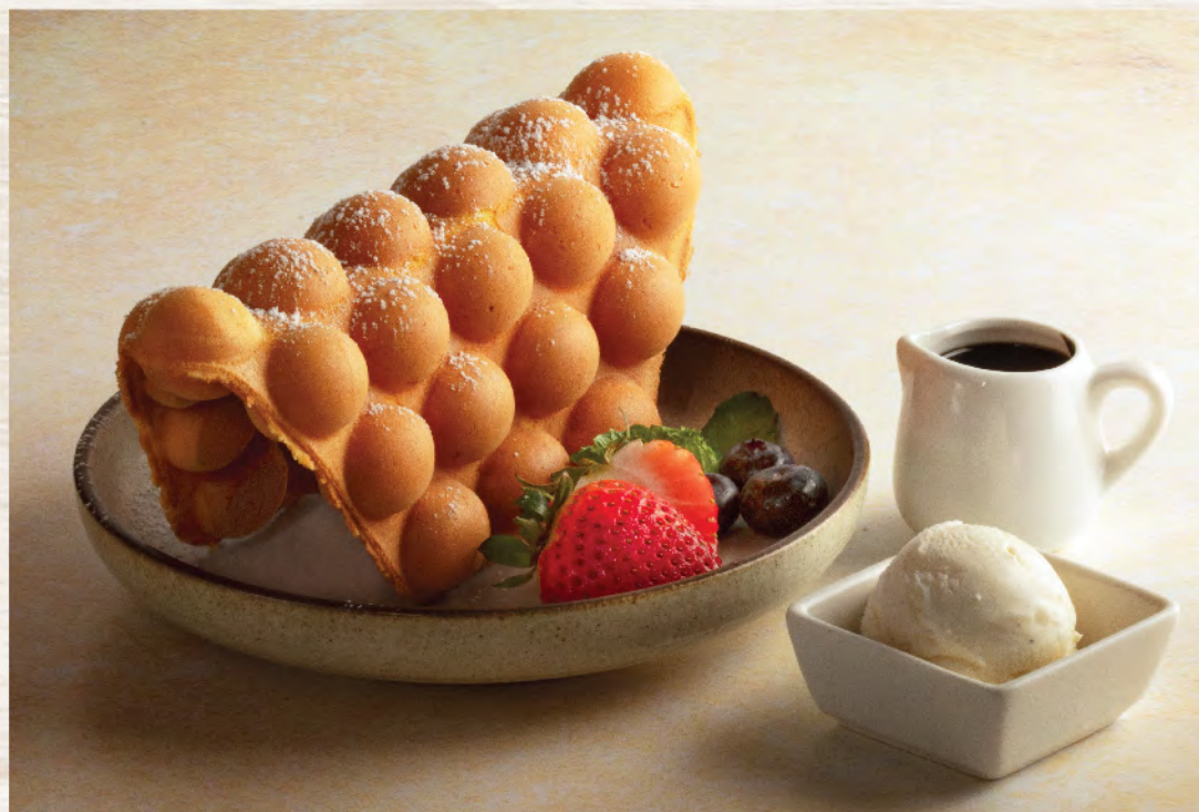
Original Egg Waffle with Ice Cream 原味雞蛋仔伴雪糕