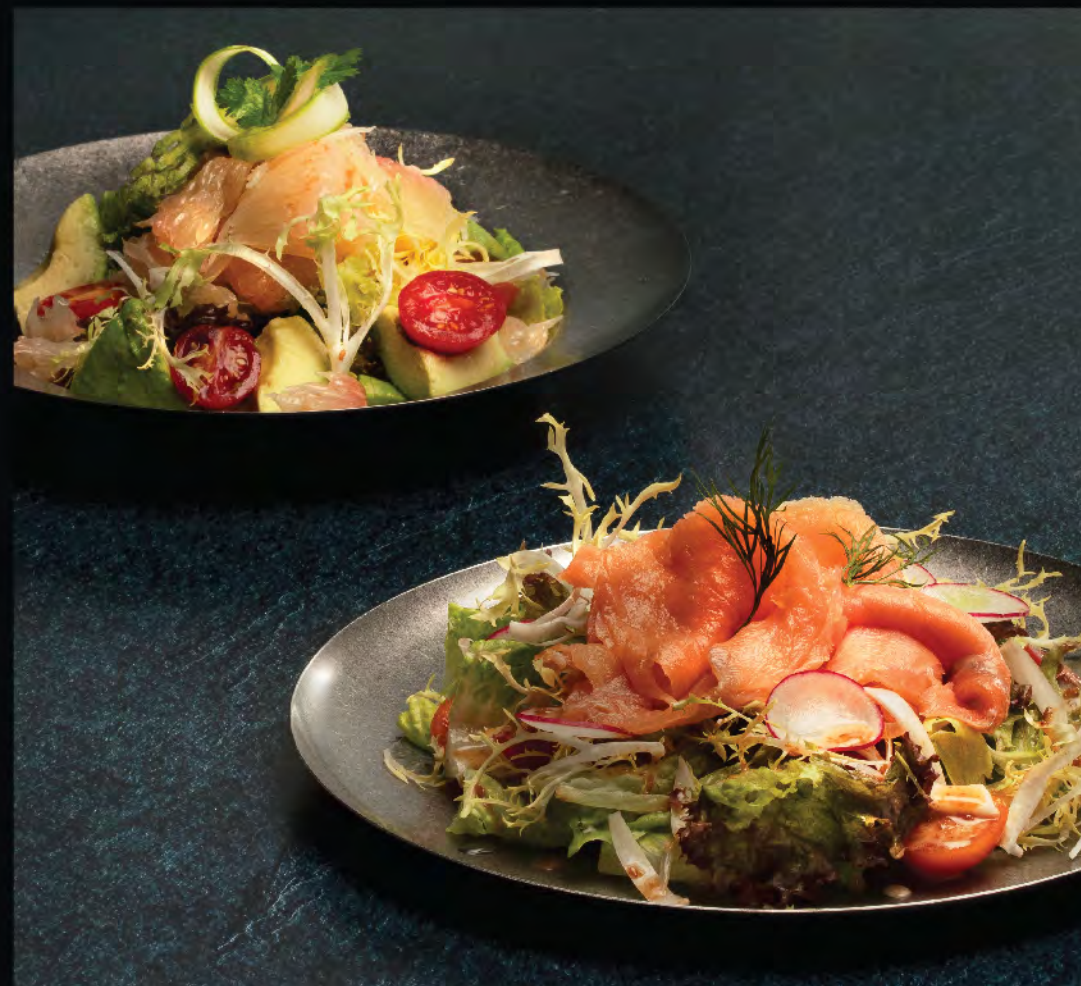
Avocado, Pomelo with Quinoa Salad 牛油果柚子藜麥沙律 ■