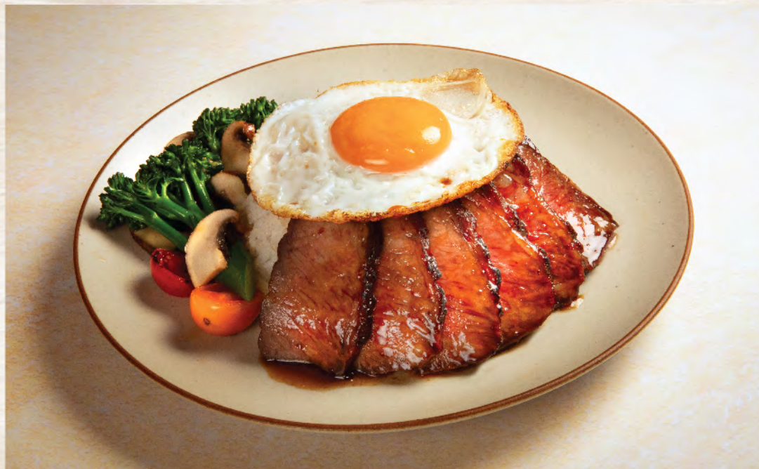
Beef Char Siu Rice with Pan-fried Egg 牛魔王叉燒煎蛋飯