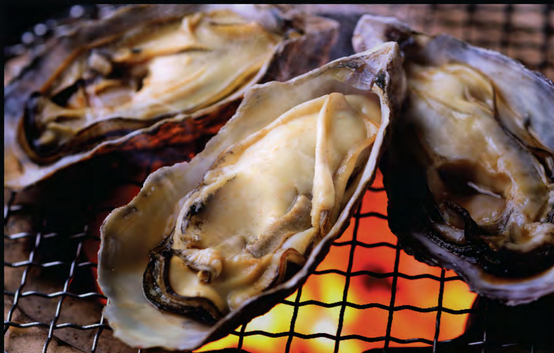
Charcoal Grilled Oysters (minimum 2pcs) 碳燒生蠔 (2隻起)