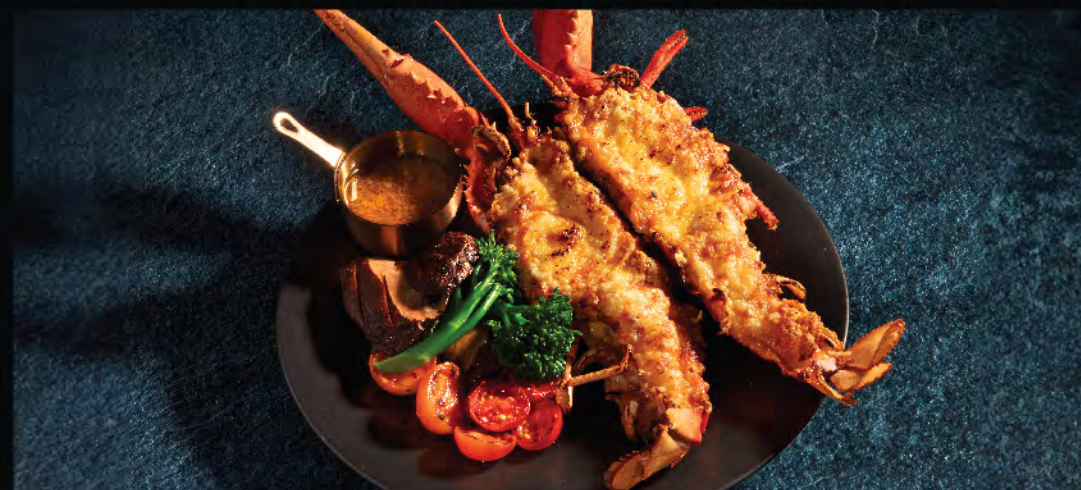
Crispy Baked Boston Lobster in Cheese 焗芝士脆皮原隻波士頓龍蝦