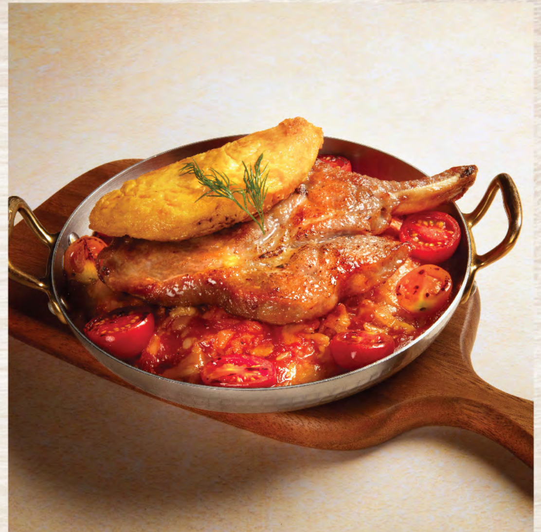
Baked Local Kurobuta Pork Rice with Tomatoes and Cheese 焗芝士鮮茄本地黑豚豬扒飯