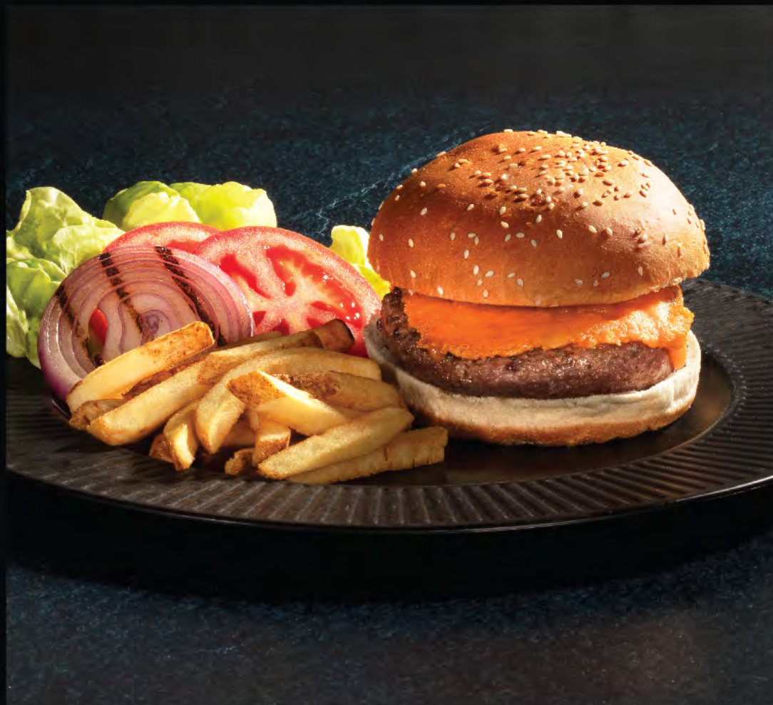
Wagyu Cheese Burger with French Fries 芝士和牛漢堡配薯條