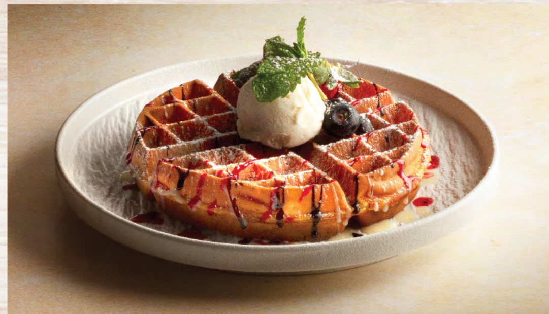
Crispy Waffle with Ice Cream 雪糕脆窩夫